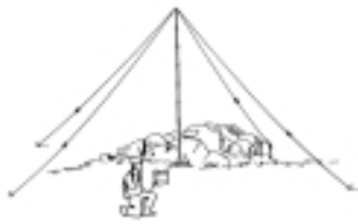
Typical Installation of an RF-1936